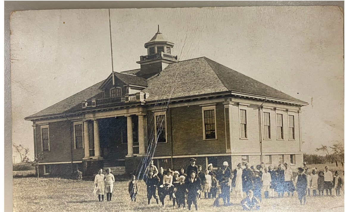
Pond Cove School 1912