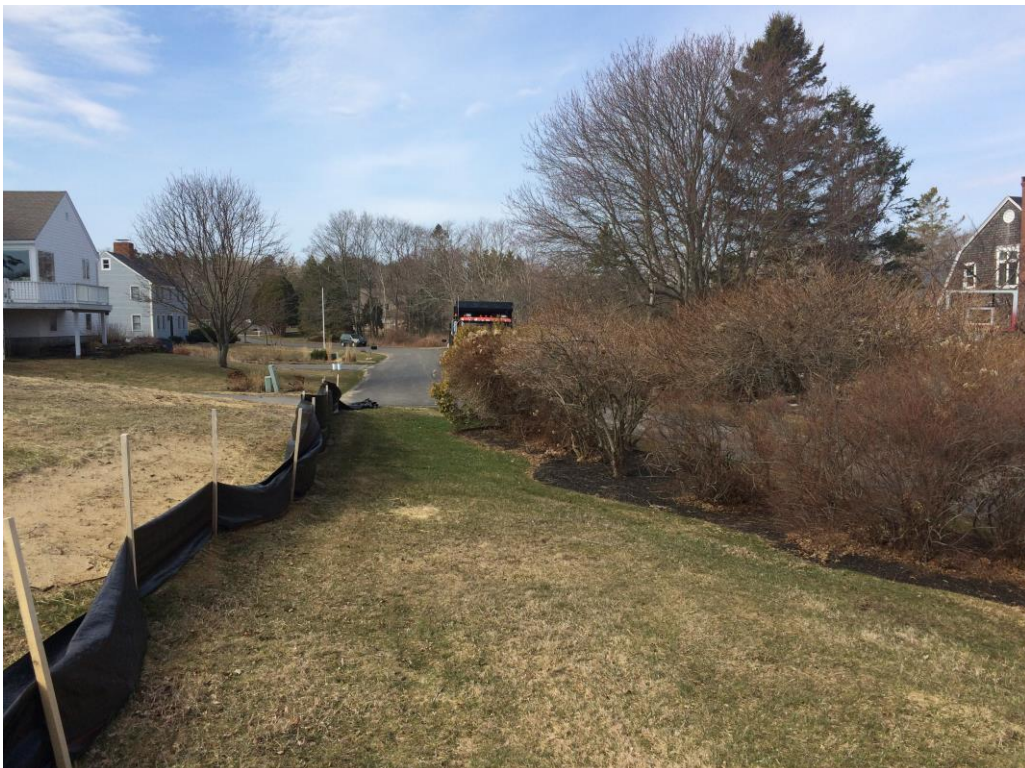
Photo 6 (04-11-17): Photo taken looking southwest near the end of the unimproved section of Lighthouse Point Road paper street. Path could readily be established in the mowed grass area between the landscaping and the black siltation fence.