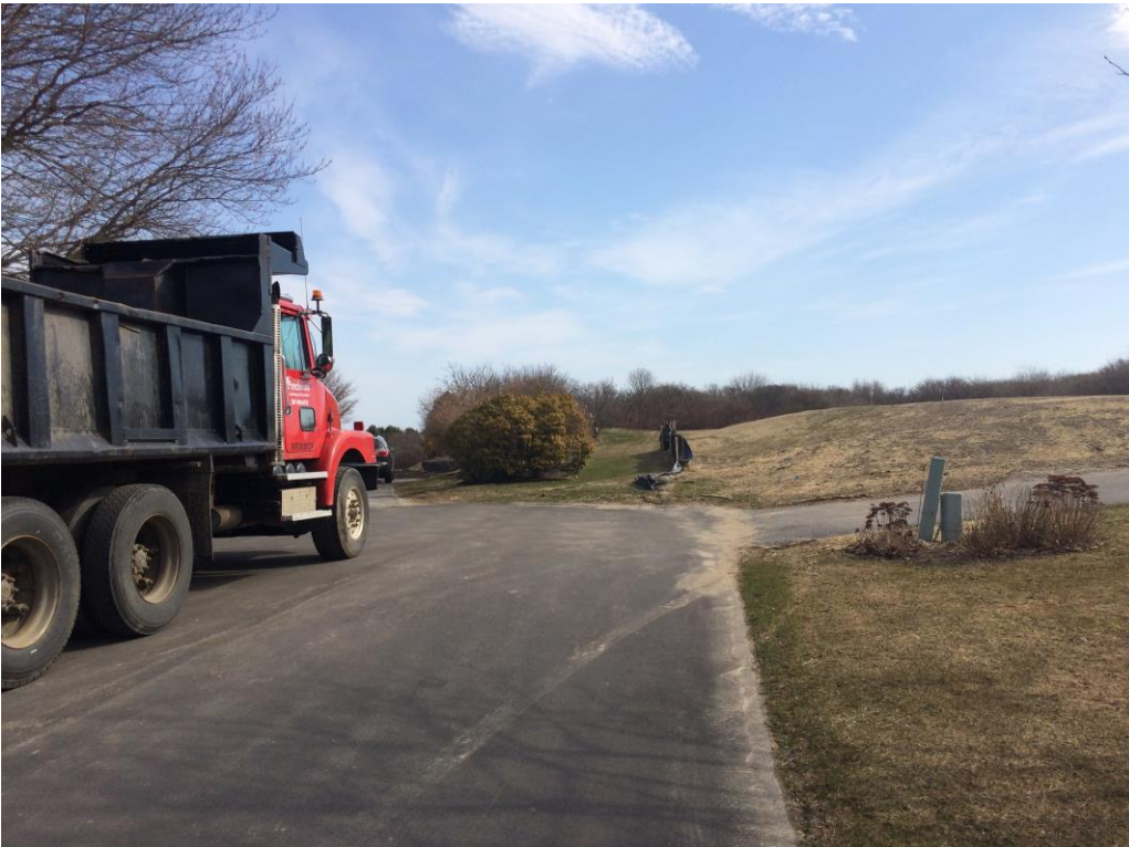
Photo 2 (04-11-17): Photo taken looking northeast from the paved portion of Lighthouse Point Road paper street section.